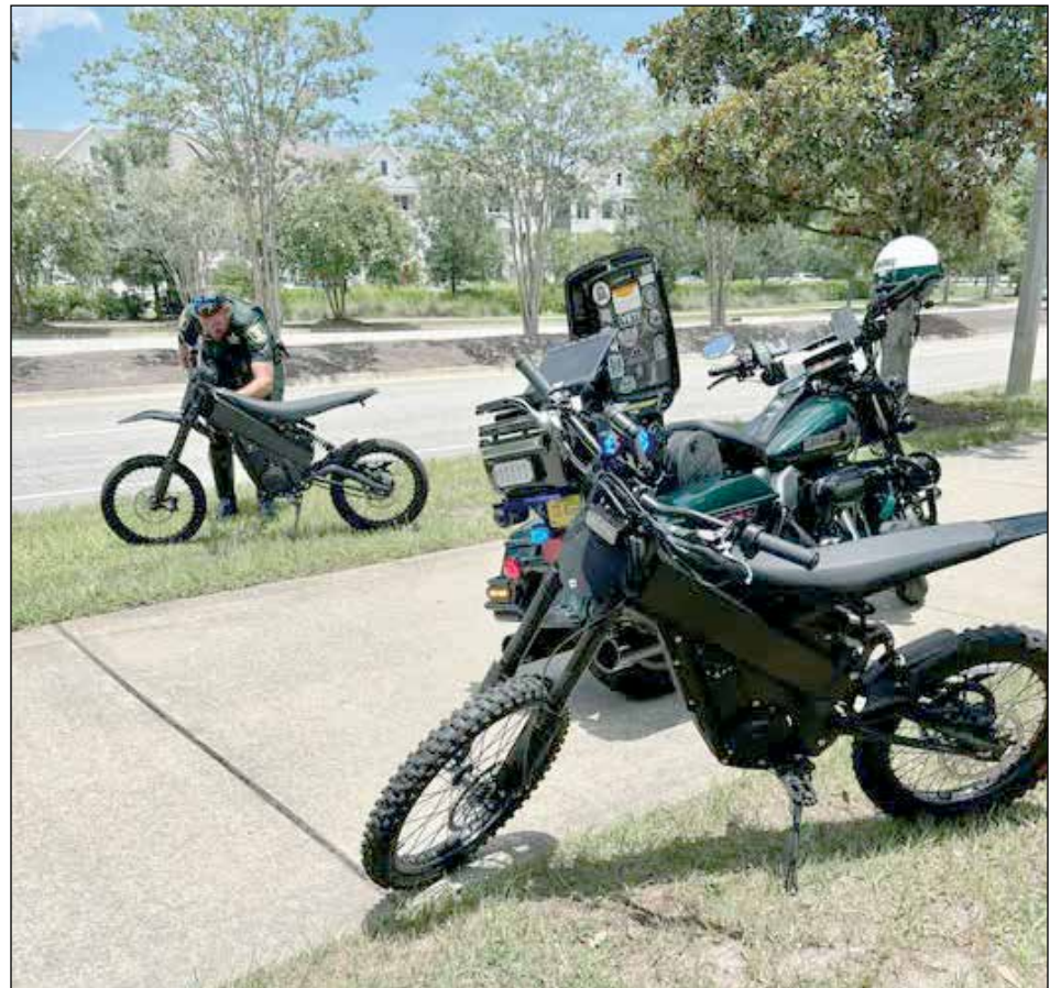
St. Johns County Sheriff’s Office deputies inspect a high-powered electric vehicle. Officials warn that certain “e-motos” are not street legal and are classified as motorcycles.