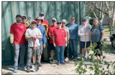
The Homeless Coalition of St. Johns County benefits from its association with Bartram Trail Rotary, which provided a food pantry facility and other assistance.

Bartram Trail Rotarians have helped with the construction of a food pantry and provided other items for the Homeless Coalition of St. Johns County,