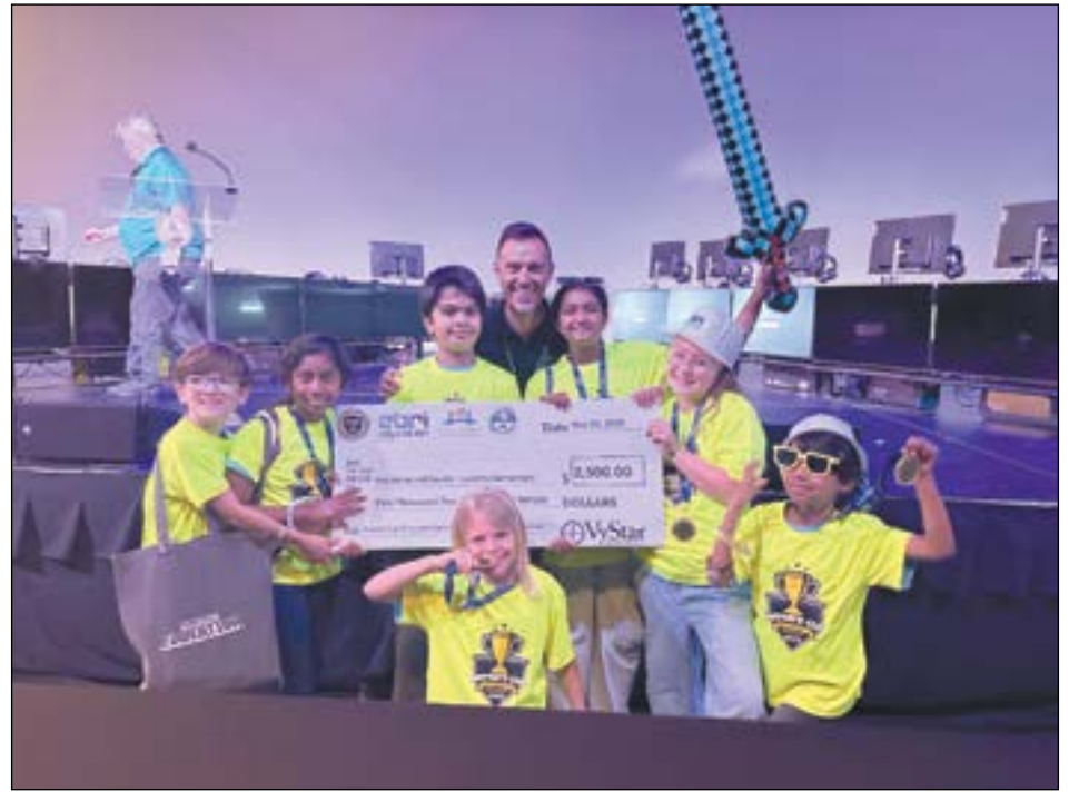
The Minecraft Nerds.

During the 30-minute live final round, teams were tasked with coding and constructing a building, designing eco-friendly small businesses within it, and creating a functional library and event space. Each team included five main members and two alternates. Both teams began by using fill commands to design a building in less than a minute, a move which impressed judges and audience