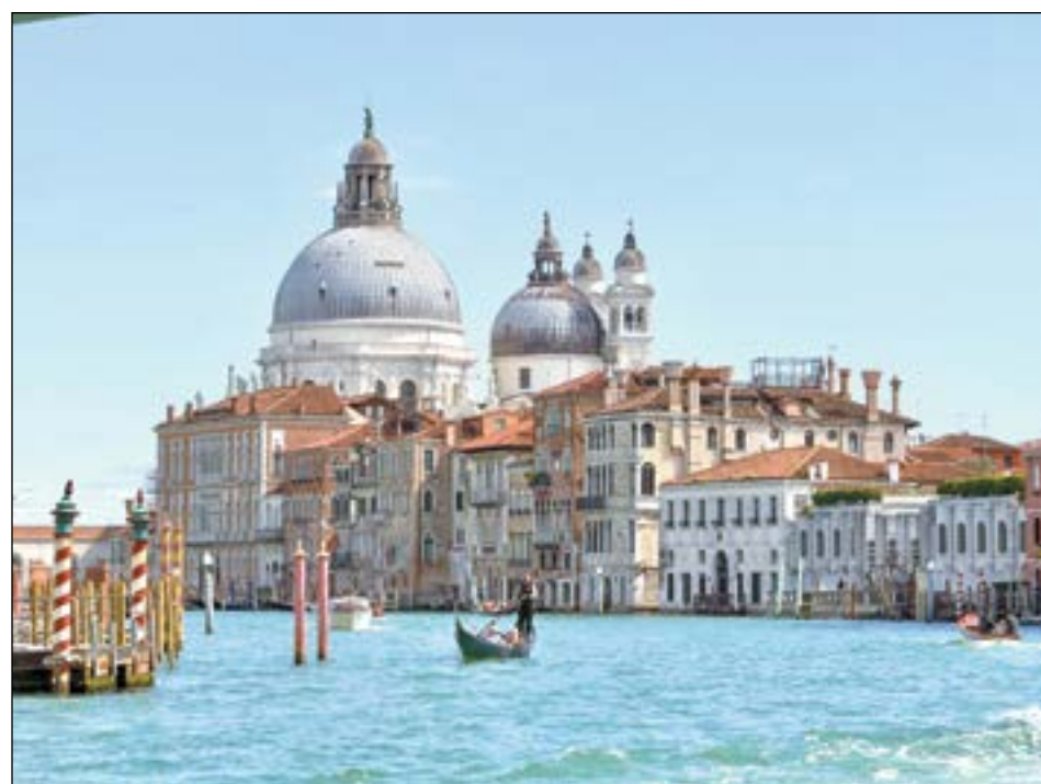
High noon on the Grand Canal.

Visit www.bylandersea.com to read more of local travel writer Debi Lander's stories and travel tips.