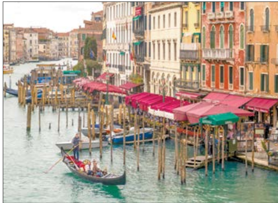
A gondola on the Grand Canal

Later, I splurged on a gondola ride—touristy, yes, but worth it. Gliding