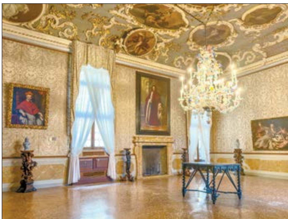
Interior of Ca'Rezzonica Museum