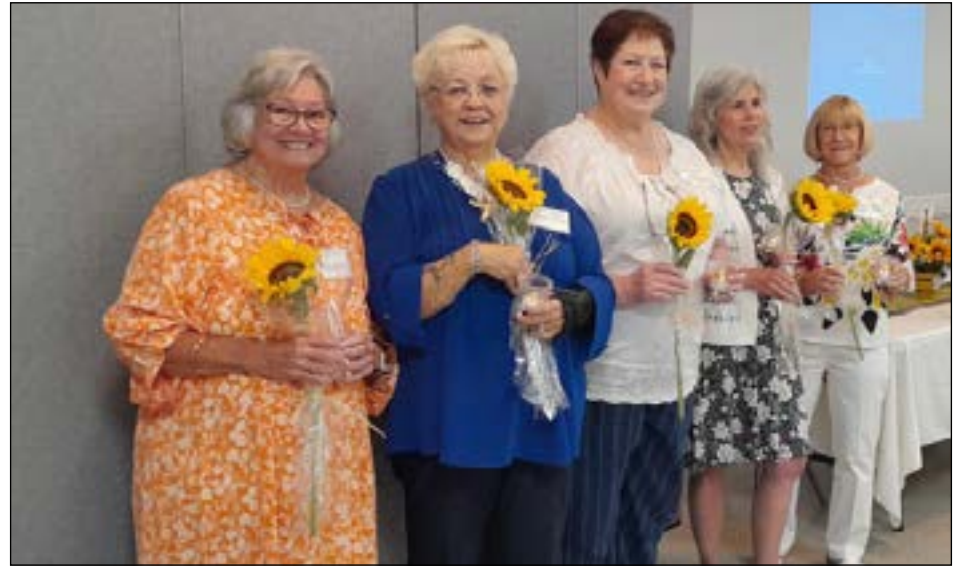
Mandarin Garden Club members celebrate at their annual meeting May 22.

A pop-up plant sale will run concurrently in the gardens, featuring bargains on green plants. Master Gardeners will be available to answer gardening questions. Early shopping is recommended for the best selections.