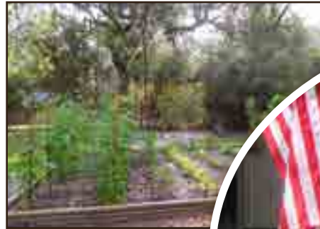
Vegetable garden cared by volunteers of the Jacksonville Extension Office