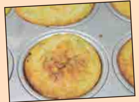
Lip-Smacking Corn Muffins

3 tbsp. chopped scallions 3 tbsp. chopped fresh cilantro ½ tsp. hot sauce