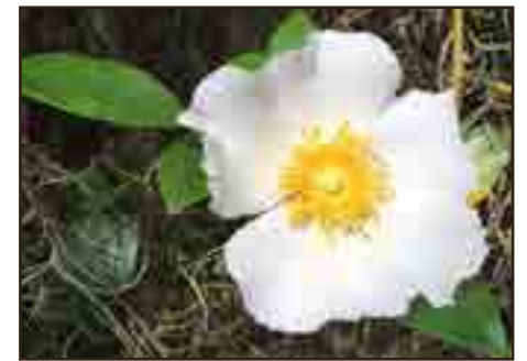
Cherokee Rose blossom found at the Walter Jones Historic Park

oaks, native plants, seasonal beds, a kitchen vegetable garden, orange trees, an orchid tree, and many other blooming plants through the seasons. The artfully maintained museum and five other historical structures make the park a pleasant place for walks through the trails or on the walkway along the St. Johns River, as well as for picnics, photography, family gatherings, and other social events.