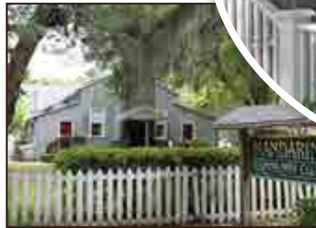
Mandarin Community Club