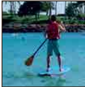
Stand-up paddling has become more popular in recent years

Would-be paddlers who are curious about the availability of places to paddle should know that more than half of all stand-up paddlers travel less than 10 miles to paddle, proving that just about any body of water provides an opportunity to engage in this activity. People interested in stand-up paddling but unwilling to make any significant financial commitment before trying it out should know that 42 percent of people who do not own paddle boards rent them from local businesses such as on-site rental providers at boathouses or marinas and independent outdoor specialty stores. That makes stand-up paddling among the more accessible activities for people looking to enjoy the great outdoors this summer and beyond.