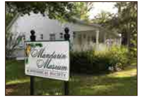
Mandarin Museum at Walter Jones Historical Park

"Mandarin Museum & Historical Society shares the stories of Mandarin's history, culture and natural resources by providing engaging programs that educate, entertain and inspire." This mission will be enhanced later this year when Mandarin Museum & Historical Society completes an expansion of the Mandarin Museum building. When this is complete there will be a brand-new interpretive exhibit room dedicated to the story of a National Historic Landmark — the Civil War steamship "Maple Leaf." It will have a revised art gallery and special exhibit room and a totally refurbished main hall, which will include a new "Black History in Mandarin" exhibit as well as an expanded exhibit about Harriet Beecher Stowe and many other stories that have not been told in the past.