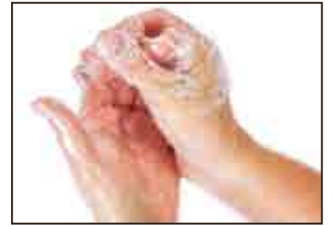
When washing with soap and water, lather and then scrub all surfaces for 20 seconds before rinsing.

When washing with soap and water, the CDC advises people to wet their hands with clean running water (warm or