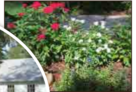
Flower bed maintained by volunteers at Walter Jones Historical Park