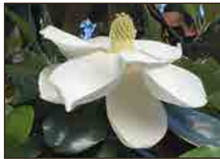
Magnolia at Mandarin Community Club

The historical park is full of beautiful