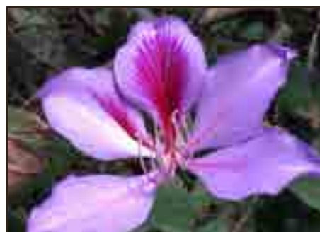
Orchid tree by the schoolhouse at Walter Jones Historical Park