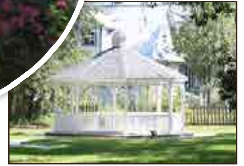
Gazebo at Billard Park